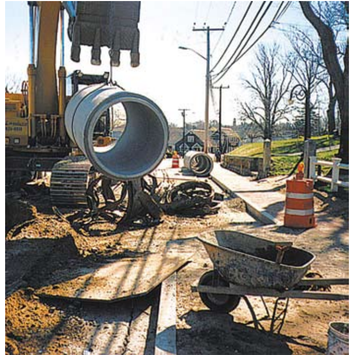
Reinforced Concrete Pipe Replaces Failed HDPE Storm Drain Installation.

First Cost – The first cost is only one of several factors that influence an economic analysis. When alternative materials have different life spans, first costs may underestimate the total cost of using different materials over the life of the project. It may be the least important factor if there are high maintenance costs or if the pipe material or system has to be replaced during the design life of the project. In fact, a study sponsored by FHWA and AASHTO found that, “Improvements with the lowest initial cost are often more costly in the long run than alternatives with higher initial costs, especially if costs of traffic delay during maintenance and rehabilitation activities in congested areas are considered.” 10 Other important factors include the project design life and material service life.