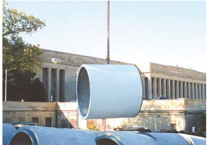
Reinforced concrete pipe used for storm water drainage system at the Pentagon.

According to the U.S. Army Corps of Engineers, selection of all systems, components, and materials for Civil Works projects are based on their long-term performance, including a Least Cost Analysis. This design criterion is referred to as Regulation No. 1110-2-8159. The